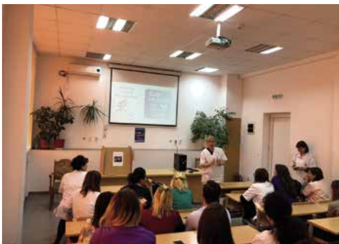
↑ GHD 2019 Romania