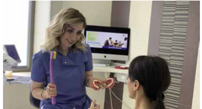
↑ GHD 2019 Azerbaijan

Many perio societies and individual periodontists also used social media and press releases to spread the health-awareness message. Among the EFP-affiliated societies, 94% used the toolkit