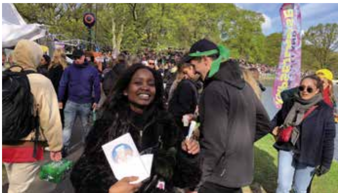
↑ GHD 2019 Denmark