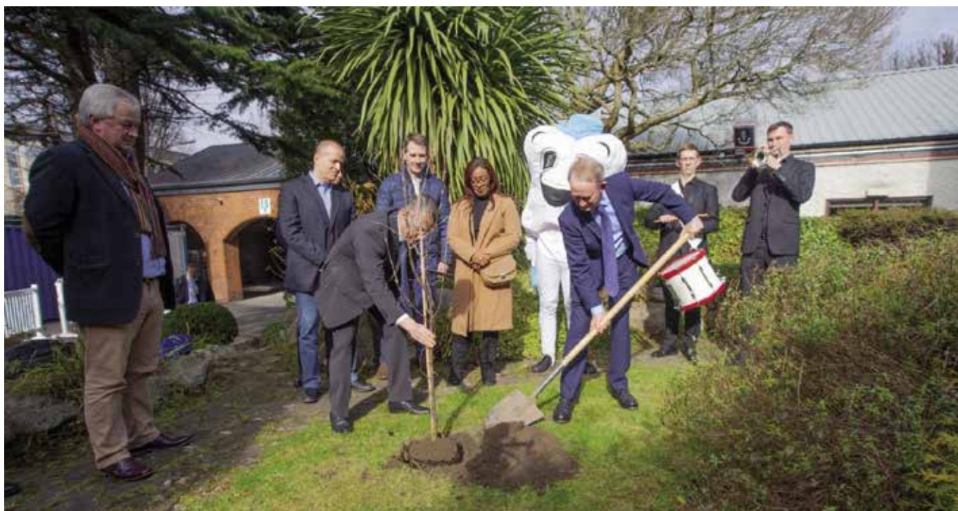
↑ As a symbol of the EFP's commitment to the environment, an apple tree was planted in the grounds of the Royal Dublin Society during Perio Master Clinic 2020.

participation at our events. The level of support that we receive is one of our strengths. Looking ahead, the EFP will provide the opportunity for participants not only to be able to attend in person but also, if they prefer, virtually. This has already been trialled with great success at the recent Perio Master Clinic 2020 in Dublin, Ireland, in March this year.